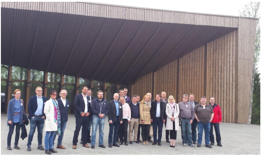
The participants (not complete) in front of Serlachius Art Museum Gösta on May 19th, 2016

The "Federation of the Finnish Woodworking Industries" hosted the Tour. The company visits were only possible by the close contacts of this member association of EuroWindoor.