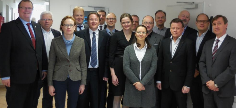
The participants of the meeting to prepare the founding of EuroWindoor AISBL on March 25<sup>th</sup>, 2015 in Frankfurt

The act of constitution of EuroWindoor AISBL was done by the authorised Executive Board at the Notary on April 28<sup>th</sup>, 2015 in Brussels.