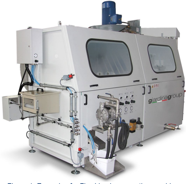
Figure 1: Example of a FlowLine impregnation machine

Besides, processes are also mostly carried out in closed loops with water-based impregnation and reuse of excess liquid in a closed system<sup>5</sup>. Other uses and working conditions are described in the assessment documents.