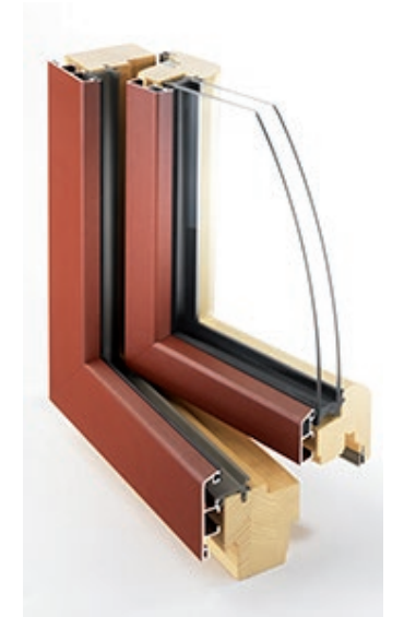
Figure 2: The outer 1-3mm of the Timber profile contains impregnation product, which is covered by a Topcoat of 100-150 µm