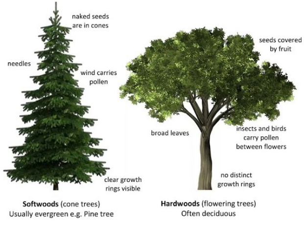
Figure 4: Distinction between Softwood and Hardwood trees

With a few exemptions both Hardwood and Softwood consist of two distinct core parts: Sapwood and Heartwood .